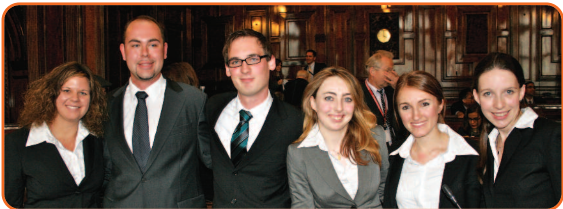
Finalists of Glasgow, 2008