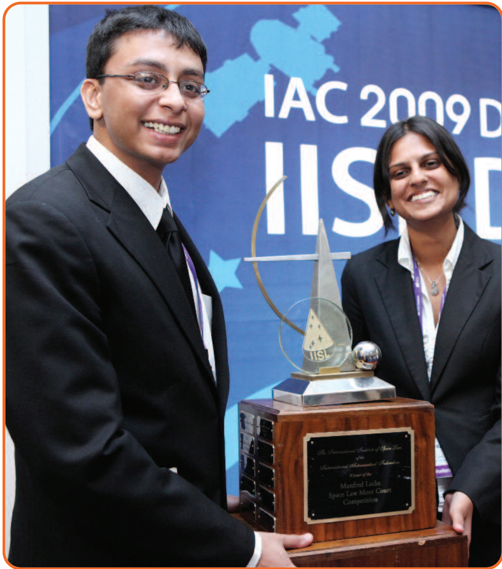
2009 Winners, National Law School of India University, Bangalore, India.