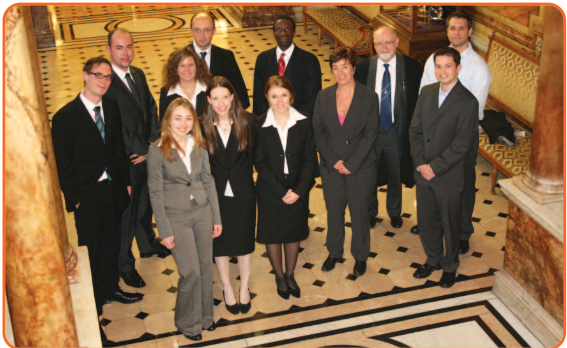
World Finals 2008, Glasgow