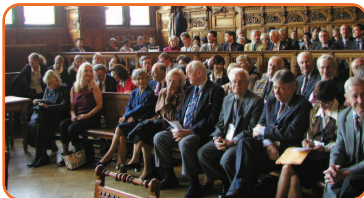
2003 Bremen audience