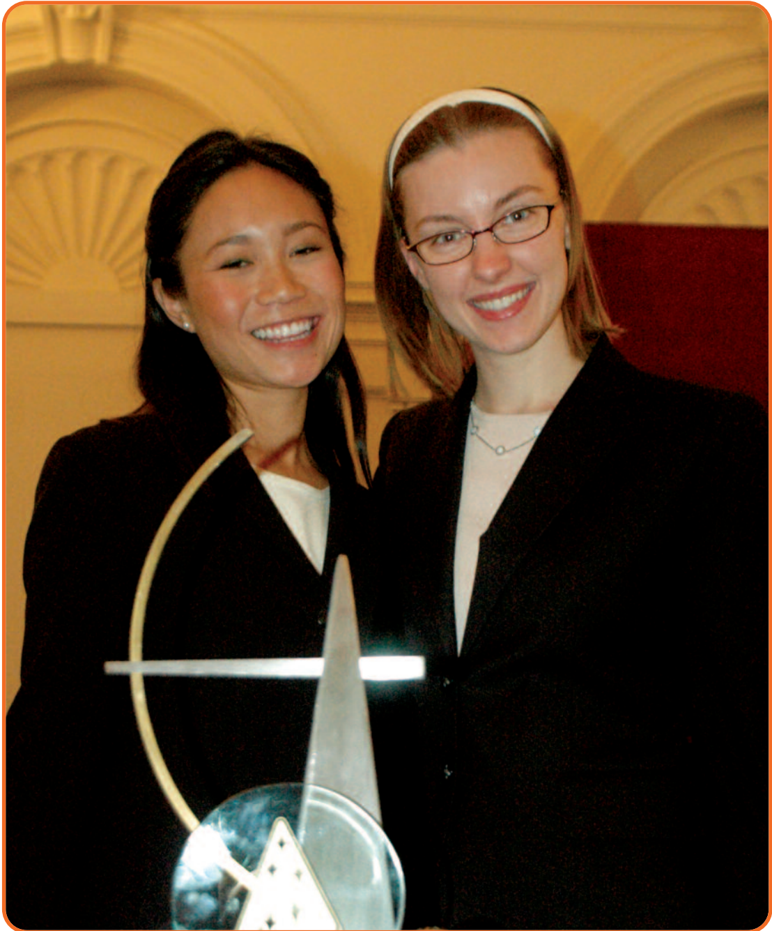
George Washington University, USA Winners of World Finals 2010, Pilsen, Czech Republic