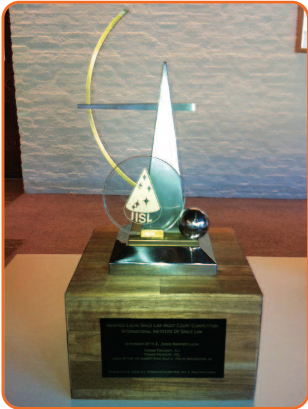
The Manfred Lachs Trophy