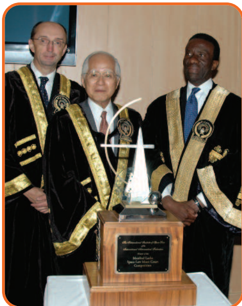
World Finals 2007, Hyderabad, India