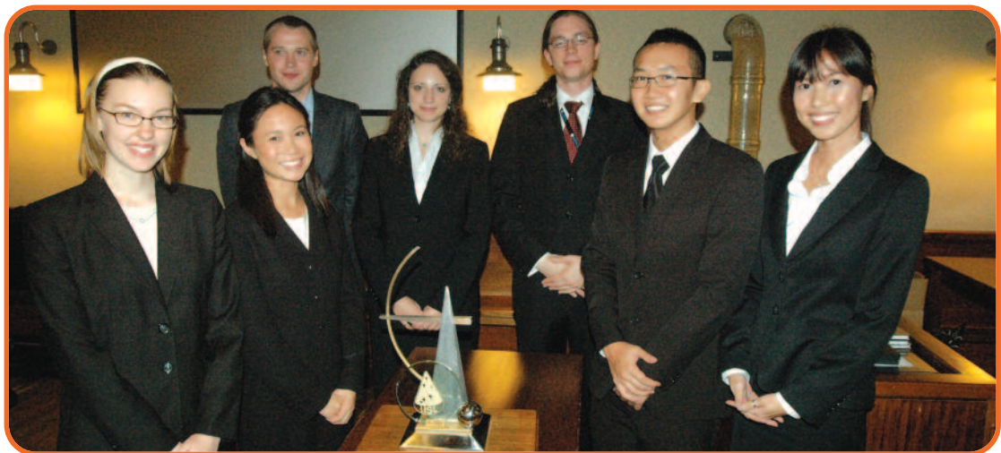
World Finals 2010, Prague/Pilsen, Czech Republic

The 20th Manfred Lachs Space Law Moot Court Competition will be held in Cape Town, South Africa. The Semi-finals will be held on Tuesday, 4 October 2011, in a closed session. The Finals are a public event and will take place on Thursday 6 October, at the Cape Town Local High Court and will be judged by judges of the International Court of Justice in The Hague.